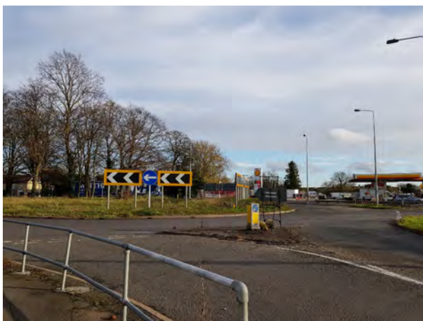
Buckden roundabout along the A1 forms a strong western edge to the village and separates Perry Road and Hardwick from the rest of the village with pedestrian access via two underpasses.