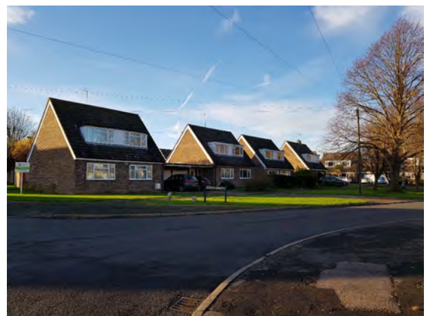
Aragon Close properties surrounding by open space and some tree planting. This is a common feature throughout the extensive residential aspects of the village although the design of houses vary