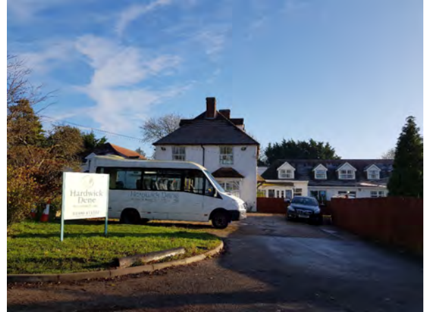
Hardwick Dene retirement home

9.51 Hardwick is a small hamlet located to the north-west of the main village. It is visually and physically separated from the main village by the A1. It is accessed via Taylors Lane with Hardwick Lane forming a loop around the small collection of properties and outbuildings. From Hardwick Lane there is an exit onto the A1 northwards to Brampton and Huntingdon. Apart from the eastern edge of the hamlet which faces onto the A1, it is located within the open countryside. Taylors Lane leads to several farms and a public right of way to the nearby village of Grafham some 2 and a quarter miles away. An underpass for pedestrian access connects the hamlet to the main village. It hosts a mixture of large farmhouses, bungalows, detached properties and some terraces reflecting characteristics of building types 2A, 2B, 3D and 3E.