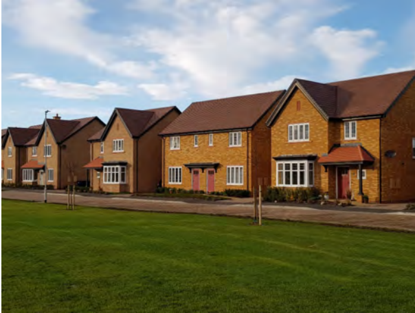
Lucks Lane development is the most significant development within the village in recent years.