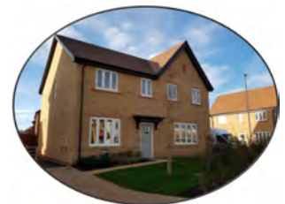
Another Lucks Lane house type

9.40 The new residential development at Lucks Lane has a range of house types many featuring traditional detailing including bay windows, window shutters, roughcast render, some cream coloured window frames, porches, and chimneys. Materials include buff and red coloured bricks giving variety and interest to the street scene, and distributed to relate to the existing buildings on Springfield Close and The Osiers. This is different to the dominant building style in the village of properties from the 1960s and 1970s. However, Lucks Lane Extension will form a generally harmonious group of buildings with a distinctive identity as other residential areas within the village have managed. The development will also be slightly higher density than those seen in the Osiers, Lucks Lane and Springfield Close. These reflects the changing house building trends and styles that have evolved over time and adds another layer of interest to the village.