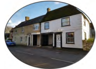
55-57 Church Street with coaching arches