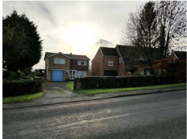
Mix of property styles and sizes along Perry Road and its steady incline

9.47 This is a smaller and linear character area located to the west of the main village separated visually and physically by the A1. The linear development along Perry Road is accessed off the B661 from the A1 roundabout which leads to neighbouring parishes Grafham and Perry. There is pedestrian access via an underpass which connects properties to the services within the main village. The character area has a collection of semi-detached and detached properties of one and two storeys demonstrating characteristics of building types 3B, 3D, 3E, 3F. The character area also includes the Shell Garage on the opposite side of the roundabout on the A1 as it has a shared character due to its location and relationship with the A1.