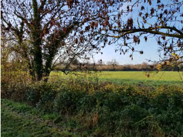
View from Hardwick Lane looking over the open countryside westwards