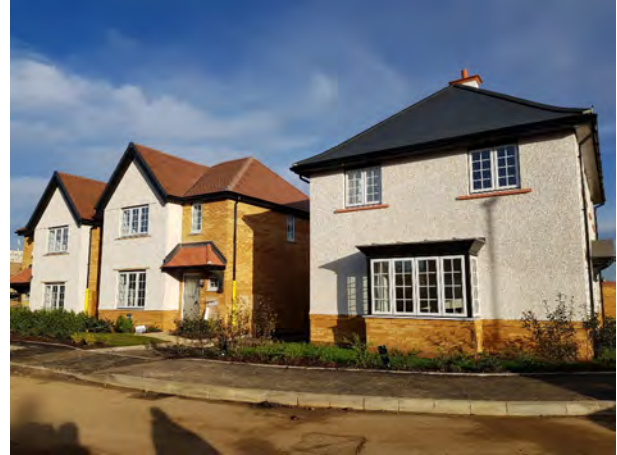
Further examples of house types within the Lucks Lane development.

9.38 This character area consists of a development on an L-shaped former agricultural field which will take the built limits of the village up to the confines of the road network (the A1 to the west and Stirtloe Lane to the south). Under construction as of 2021, this major development will provide the greatest concentration of design principles and trends of 21st century building (building type 3F). Lucks Lane will as a result have a different character and feel to the 20th century residential estates to the north justifying its own character area.