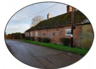
Dower House outbuilding

9.43 The key element of this character area is Stirtloe House and its former coach house and stables, all grade II listed, reflecting building type 2E. Stirtloe House is a late 18th century L-plan brick house of five bays with hipped slate roofs and end stacks. The house is accessed via a listed gate which dates to the middle of the 19th century with iron gate piers and fluted columns. The house was extended in the early 19th century and has several recessed hung sash windows with glazing bars. It is still used as a single house. Its former coach house and stables have been converted and are now known as Dower House. This is an early 18th century house with hayloft of two storeys, red brick with steeply pitched hipped slate roof. These properties and outbuildings are set behind a boundary wall (some of which is listed) dating to the early 18th century, constructed of Flemish bonded red brick.