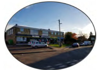
Hunts End shops