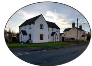
23a and 23 Mill Road example infilling