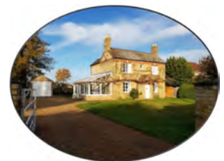
Property opposite Stirtloe House

9.44 The boundary wall provides a clear distinction between the grounds of Stirtloe House and the 19th century properties and farm buildings opposite, reflecting building type 2B and 4. Low Farm is a detached two storey property constructed of red brick and red concrete plain tiles to the roof. Within its grounds are a collection of farm buildings (building type 4) with several trees protected under a Tree Preservation Order on its boundary along Stirtloe Lane. The residential properties are a mixture of detached and semi-detached properties, some have had modern extensions.