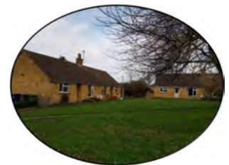
Cranfield Way bungalows

9.34 The northern part of this character area marks a transitional point between historical development and modern 20th century development at Manor Gardens which branches off from Church Street. Properties are predominately two storey, however there are bungalows like those in Cranfield Way. Materials range from red, buff and grey brick, weatherboarding, tile cladding and brown pantile roofs. Further variations in design are seen in Morris Close and the Grove where Mock Tudor decorative panels and red brick have been used, these are typical of slightly later building designs used since the 1980s (building type 3E).