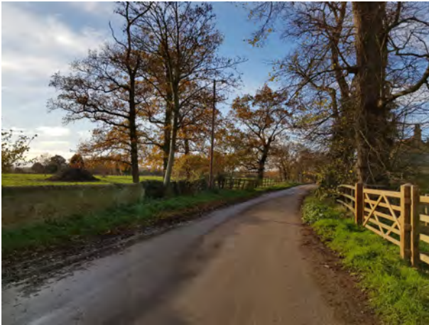
View from Stirtloe Lane demonstrating the quieter nature of this part of the village