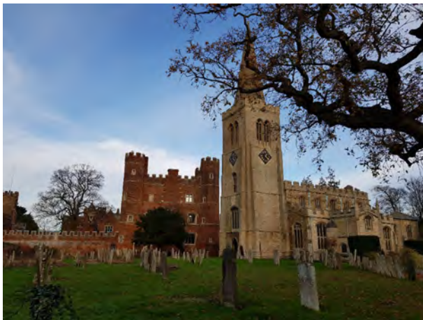
Buckden Towers and St Mary's Church are key local landmarks and forms the centre of Buckden's rich historic centre.