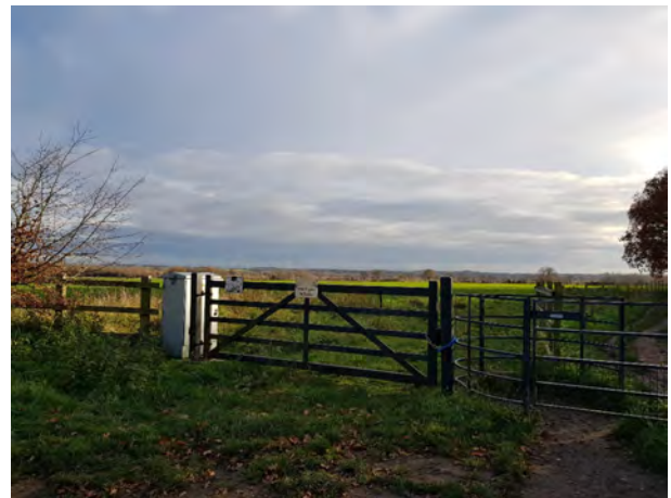
View across the Great Ouse Valley Landscape Character Area from Stirtloe Lane. The open landscape to the east of the village frames the village and provides a distinct rural setting with public rights of way encouraging its enjoyment and connecting the village to neighbouring communities in Diddington and the Offords.