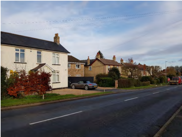
Perry Road street scene