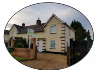
Great North Road property

9.48 Properties are set back from the road with tree and hedge planting creating a green feel to the area and clearly separating public and private space. Properties are set within generous rectangular plots with rear gardens extending out into the open countryside. There is a broad mixture of designs and styles. The oldest properties in the character area are those facing on to the A1 which date from the early 20th century. Several more properties were built by the 1950s. They have a simple rectangular plan, red brick, render, decorative gables painted in black and white, with bay windows. Adding further diversity in design and appearance are several bungalows and chalet bungalows interspersed along Perry Road.