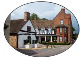
The George and Old Forge, High Street

9.10 The historic centre predominately follows the outline of the Buckden Conservation Area, focusing around Buckden Palace (Towers) and St Mary's Church and extending along the High Street, Church Street, Lucks Lane, Silver Street and Mill Road. The historic core is centred around Buckden Towers and St Mary's Church located at the junction of the High Street and Church Street which form the two principal roads in the village's street pattern. The importance of the route as a national highway between London and Edinburgh is shown in the width of the High Street. The decline of the coaching routes following the arrival of the railway network greatly impacted the village. As traffic volume increased along the Great North Road, an A1 bypass to the west of the village was installed with the Great North Road now forming the High Street with several shops, pub and two hotels with restaurant.