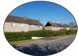
Silver Street with modern additions

9.18 Properties along St Hugh's Road utilise weatherboarding and garages to the front elevation, there is clear distinction between public and private space by hedges and brick boundary walls typical of building type 3D. There have been some modern additions and alterations over time. Over the road is Taylors Lane, a small collection of properties which continues this character area to up to the edge of the A1. North of St Hugh's Road, Lincoln Close consists of approximately 30 properties of a red brick design either semi-detached or terraced with short front gardens. There is a central green space creating an attractive central feature and providing a sense of place.