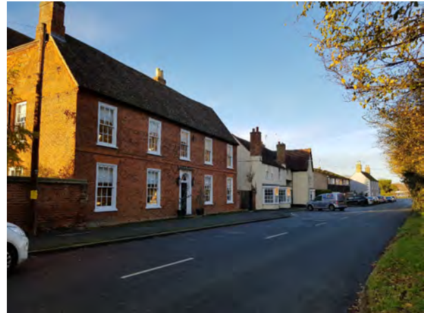
Georgian properties, especially those constructed of red brick, are a key feature of the historic centre creating a rich sense of place to the village.

9.10 The historic centre predominately follows the outline of the Buckden Conservation Area, focusing around Buckden Palace (Towers) and St Mary's Church and extending along the High Street, Church Street, Lucks Lane, Silver Street and Mill Road. The historic core is centred around Buckden Towers and St Mary's Church located at the junction of the High Street and Church Street which form the two principal roads in the village's street pattern. The importance of the route as a national highway between London and Edinburgh is shown in the width of the High Street. The decline of the coaching routes following the arrival of the railway network greatly impacted the village. As traffic volume increased along the Great North Road, an A1 bypass to the west of the village was installed with the Great North Road now forming the High Street with several shops, pub and two hotels with restaurant.