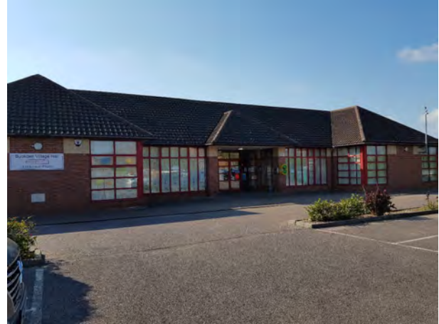
Buckden Village Hall is an one example of the many community services and leisure facilities within the character area