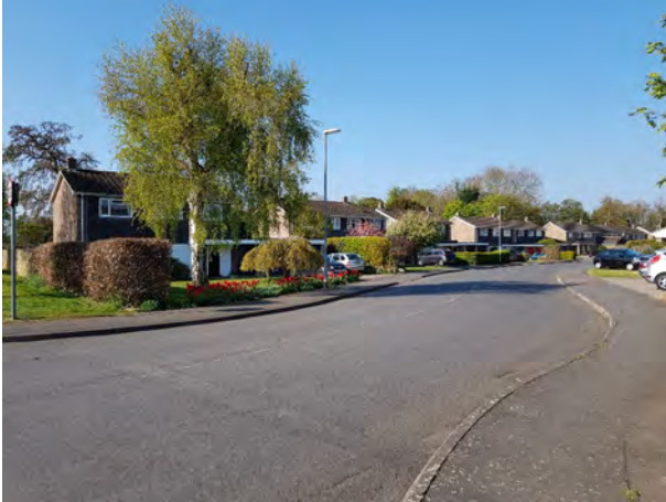
St Hugh's Road spacious and green street scene