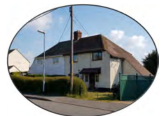
Silver Street arts and crafts influenced housing

9.19 Properties along Silver Street are semi-detached with some detached and have some influences of arts and crafts style and contrast with the overall design and materiality of the area being white rendered with red roof tiles or consisting of precast concrete panels. Properties have low boundary hedges to the front separating them from the road and footpath. Homes on the eastern side adjoin allotment grounds. At the southern end of the character area is the Spinney, this is an attractive thatched roofed cottage with dormer windows and adjoining a pair of Edwardian houses. As Silver Street continues southwards, there is a point of transition between these homes and the School Lane/ Greenway character area.