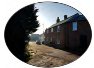
Terraces along Hardwick Lane with A1 access

9.52 Historically, the majority of the character area was used as allotments with the earliest properties located along the northern track of Hardwick Lane. A small cluster of 19th century terraced properties are located on the north eastern corner of the character area facing onto the A1. These are of modest appearance and symmetrical design constructed of red brick and slate roofs. To the south of Hardwick is one of the older properties in the character area. 17 Taylors Lane is a grade II listed property dating from the middle of the 19th century. It was formerly three terraced properties but underwent conversion in the 1980s to form one large property.