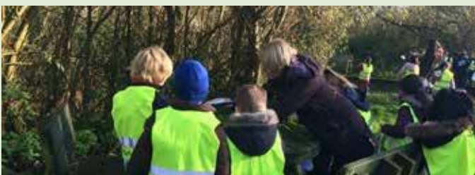
Lots of interesting things to see