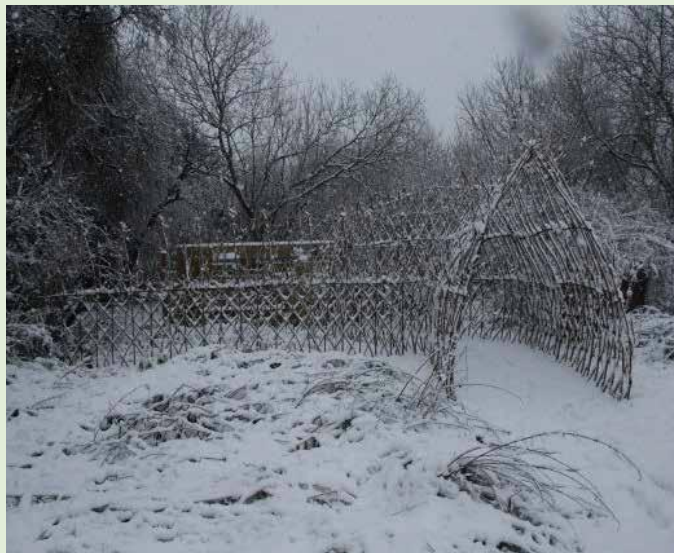
Willow Tunnel in the snow

Due to the success of the willow tunnel we are looking at adding a new section of willow wall along the grass path by the backwater this winter.