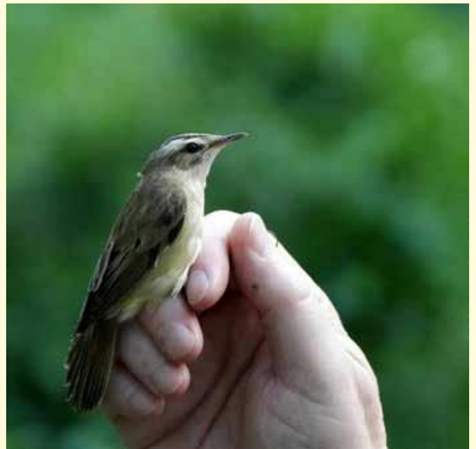
Sedge Warbler

The Warblers had a poor to average year partly because the main reed bed suffered early in the year and had very few flowers and there was an invasion of goose grass that swamped parts of the reed bed. But we did have Sedge Warblers present which is the first time for about four years, three were ringed.