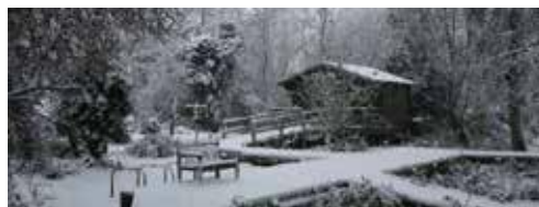
The Holt in the snow