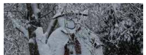
Chill Bill in the snow!