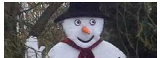
Chill Bill in the sun!