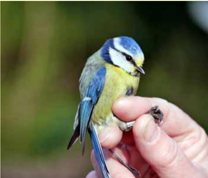
Blue Tit with yellow face

We have found that the populations on the Island vary during the year. The Blackbirds have a resident population and in the winter there is an influx of continental Blackbirds which are larger and that have a slight colour variation. Species that have increased in number during the year include Song Thrush, Blue Tit and Great Tit. The Great Tits had a poor year in 2016 when we ringed 64 new birds, but in 2017 we had a fifty percent increase in new birds ringed at 97. This seems to be partly due to an influx of birds from the Golf Course area which is being redeveloped and had at least temporarily pushed the birds out.