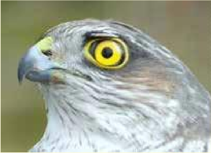
Female Sparrow Hawk

We had a successful year catching birds on Holt Island. We visited 17 times catching 984 birds of which 415 were newly ringed, 550 were re-trapped and 16 were young in nest boxes. In all we caught 26 species. The most spectacular was a female Sparrow Hawk with incredibly sharp talons.