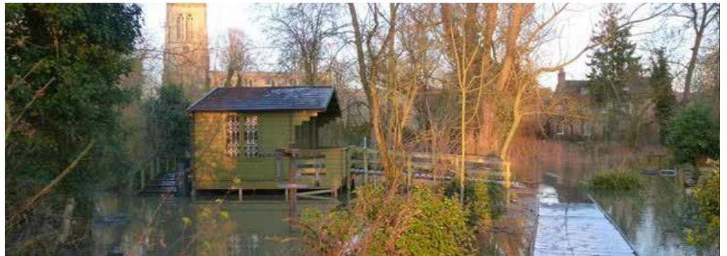
The Holt during the flood

The big news for this season is the weather! We have had snow, flooding and extreme winds so far, challenging for wildlife and people. The bird feeders on the island are literally life savers in these conditions, and our volunteers continue to keep them topped up regularly. We were worried that the badgers in their underground sett would be badly affected by the flooding, but happily they have been seen since the water went down, very busy and very muddy. The female badger (sow) gives birth in February, so we are hopeful that the activity is in preparation for a new litter. We will be using the night camera to keep an eye on the sett.