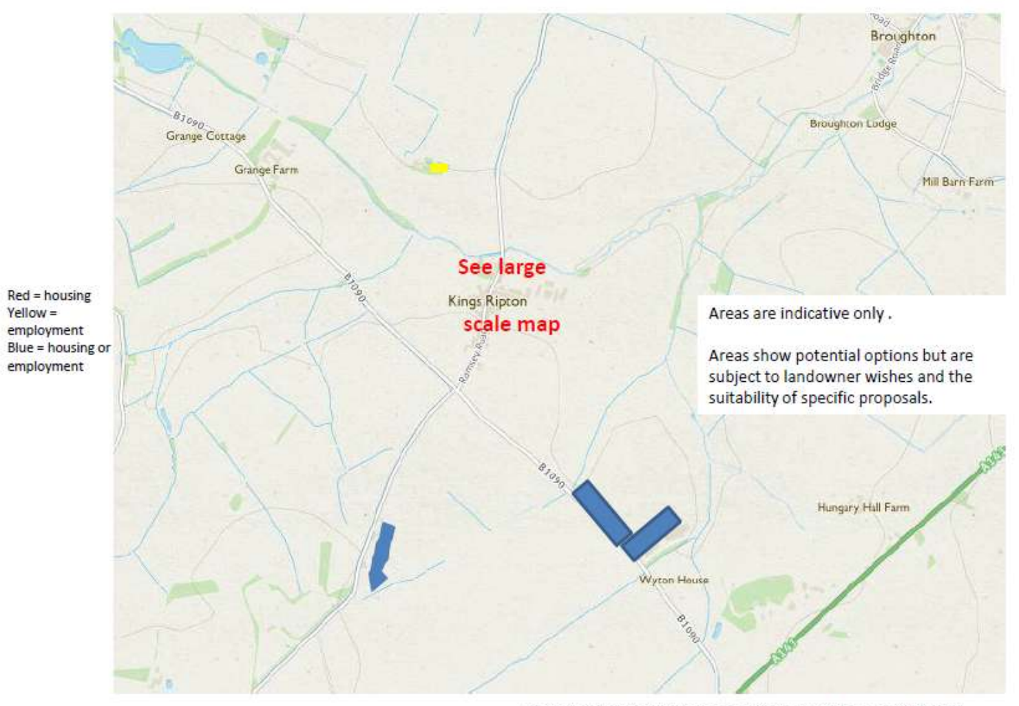
Contains OS data © Crown copyright and database right 2017