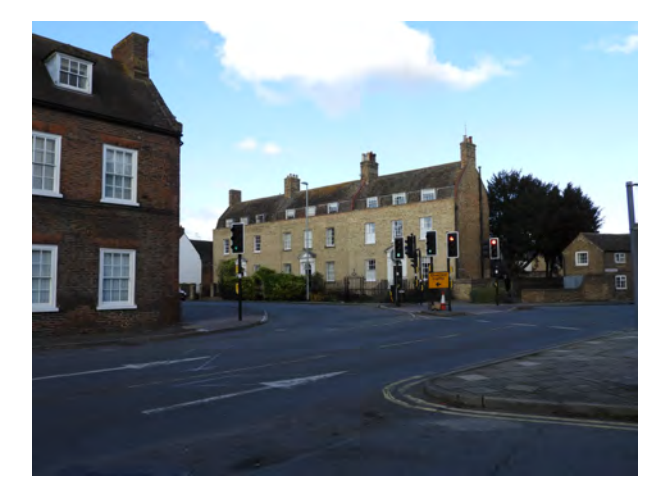
Ring road to Ermine Street junction with no. 77,78 and 79 Ermine Street in the background and 81 High Street to the left. This demonstrates the influence of traffic infrastructure on the setting of historic routes and how this relationships changes over time