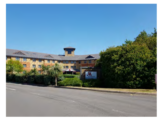
The Marriott Hotel

Huntingdonshire District Council | Huntingdonshire Landscape and Townscape Supplementary Planning Document 2022