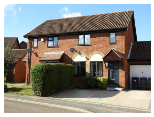
Further house type found and found across 'The Birds' estate in Sparrowhawk Way