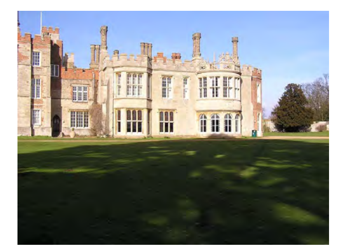
Huntingdon Character Area 20: Hinchingbrooke Civic Area

Huntingdonshire District Council | Huntingdonshire Landscape and Townscape Supplementary Planning Document 2022