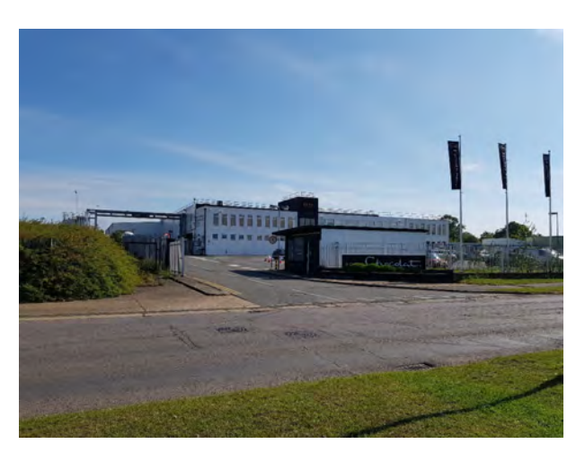
Hotel Chocolat located within the St Peter's Industrial Area it is one example of industrial units within Huntingdon. Huntingdon has several industrial areas located on the edge of the town and are key sources of local employment.