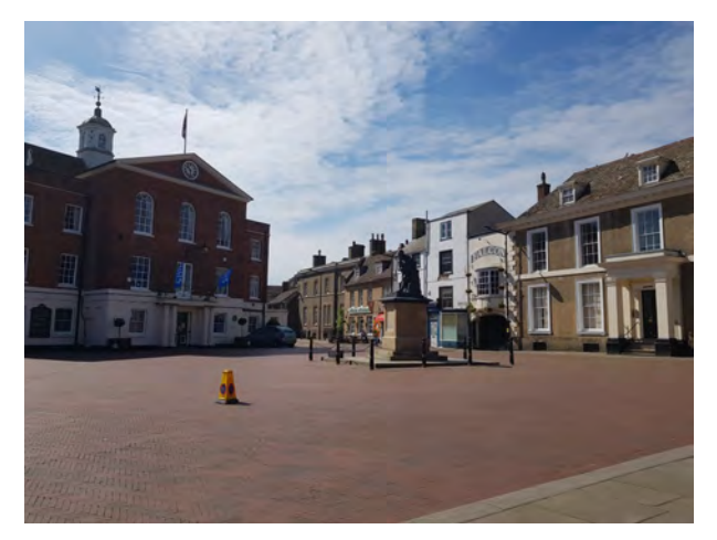
Market Square with a central war memorial enclosed by the Town Hall, All Saints Church and other listed buildings