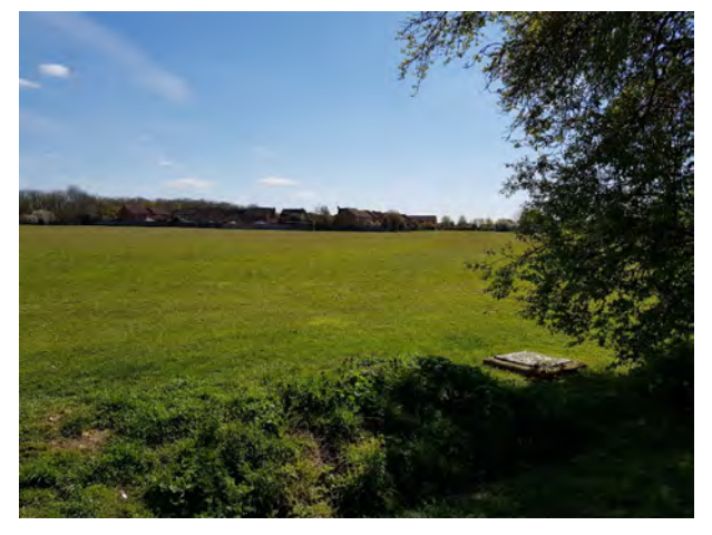
Sapley recreation ground

Huntingdonshire District Council | Huntingdonshire Landscape and Townscape Supplementary Planning Document 2022