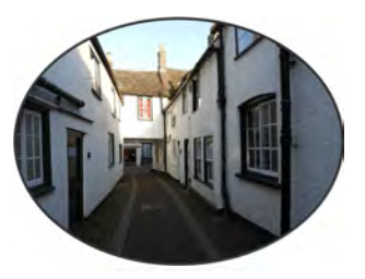
Royal Oak Passage

held), churches, the Commemoration Hall and the grade II* listed Castle Hill House formerly used by the Pathfinder Squadron during the Second World War but now used as offices. Also Cowper House at the southern end of the High Street is an early 18th century red brick former house now used as offices. Above the modern shopfronts lie many clues to the historic origin of buildings along the High Street such as number 66 which has a frieze incised 'Implement Depot' and number 111, formerly the Fountain Inn, whose Venetian style window lit the Assembly Rooms.