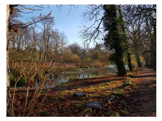
The Ornamental Lake within Hinchingbrooke Country Park is an attractive feature in a woodland setting and rich in biodiversity.

Huntingdonshire District Council | Huntingdonshire Landscape and Townscape Supplementary Planning Document 2022