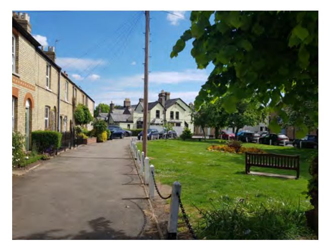
There is an intimate relationship between the terraced housing and the square. The former public house can be seen in background.