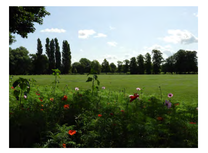
Riverside Park provides significant opportunities for leisure and recreation, it is located on the eastern edge of Huntingdon and ties the settlement strongly to the Great Ouse Valley landscape