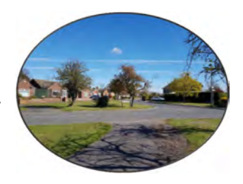
Spacious layout along Desborough Road

5.58 This is an established residential area with few opportunities for significant development, however some infill and extensions and alterations to existing properties can be accommodated.