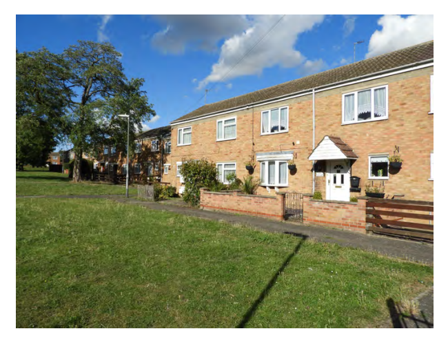
Kent Road shows the open space and pedestrian access to frontages common in the Radburn layout