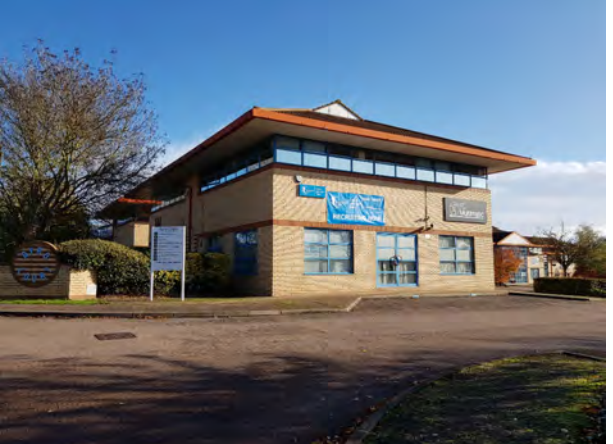
Avro Court business unit demonstrating the architectural detailing and style found within the business park