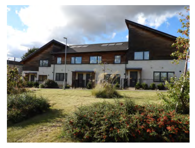
The Whaddons provides an example of the successful integration of redevelopment