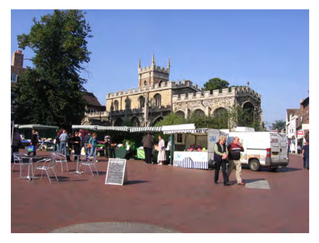
Huntingdon Market Square is dominated by the red brick paviours but surrounded by a wide variety of building types