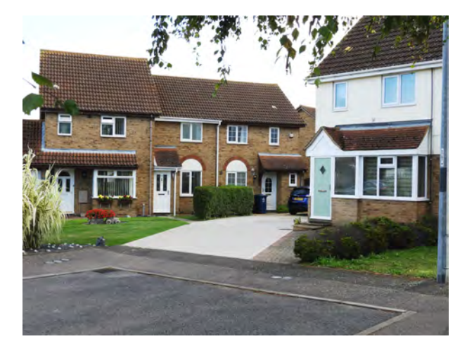
Houses on Sparrowhawk Way represent the mixed sizes found in the many cul-de-sacs which dominate the layout of 'The Birds' estate in Hartford

Huntingdonshire District Council | Huntingdonshire Landscape and Townscape Supplementary Planning Document 2022