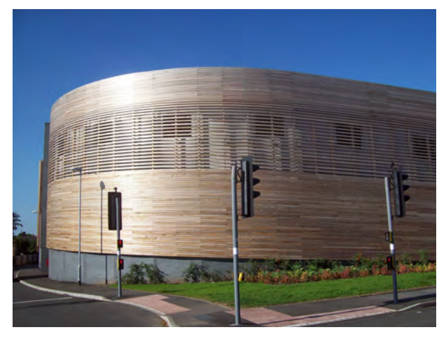
Multi-storey car park - blending modern design into the conservation area