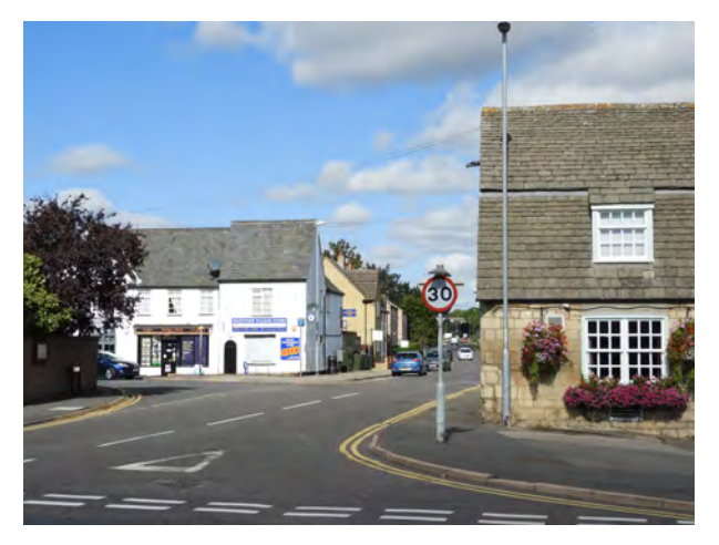
Cottages along Church Lane with All Saints Church in the background