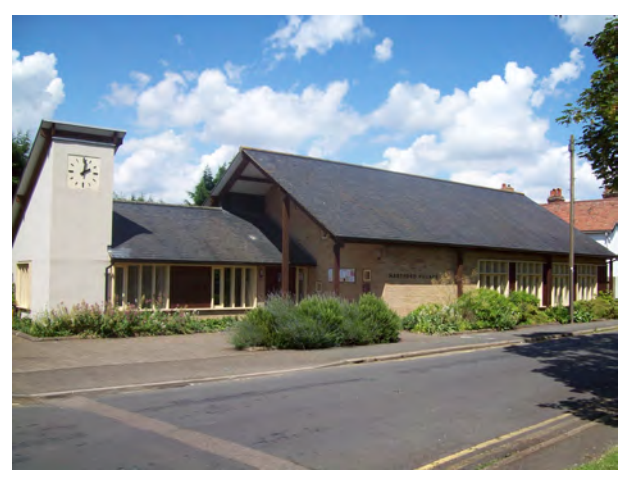
This bungalow on Arundel Road is typical of many in the immediate Hartford Village Hall is typical of modern civic buildings and provides locality forming an area of relatively low density housing