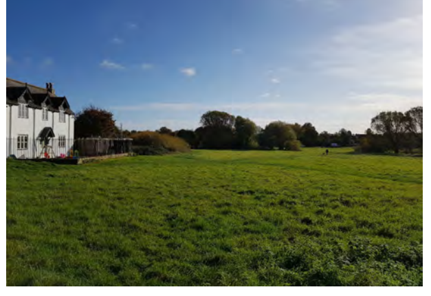
Properties along St Peter's Road dating from the early to middle 20th Spring Common open space with Spring House to the left of picture. century