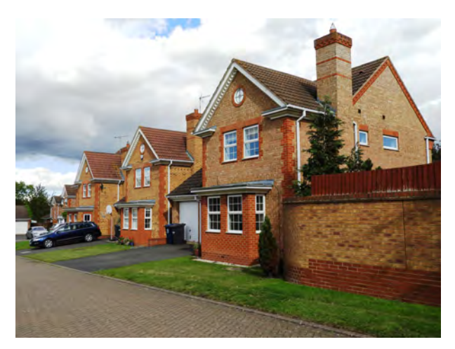
Flamsteed Drive - large detached houses with brick detailing