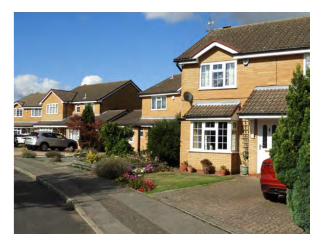
Grasmere is typical of the buff brick detached houses with shallow front gardens predominating on the main routes through Stukeley Meadows