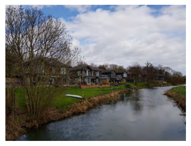
Large detached homes overlooking Portholme Meadow