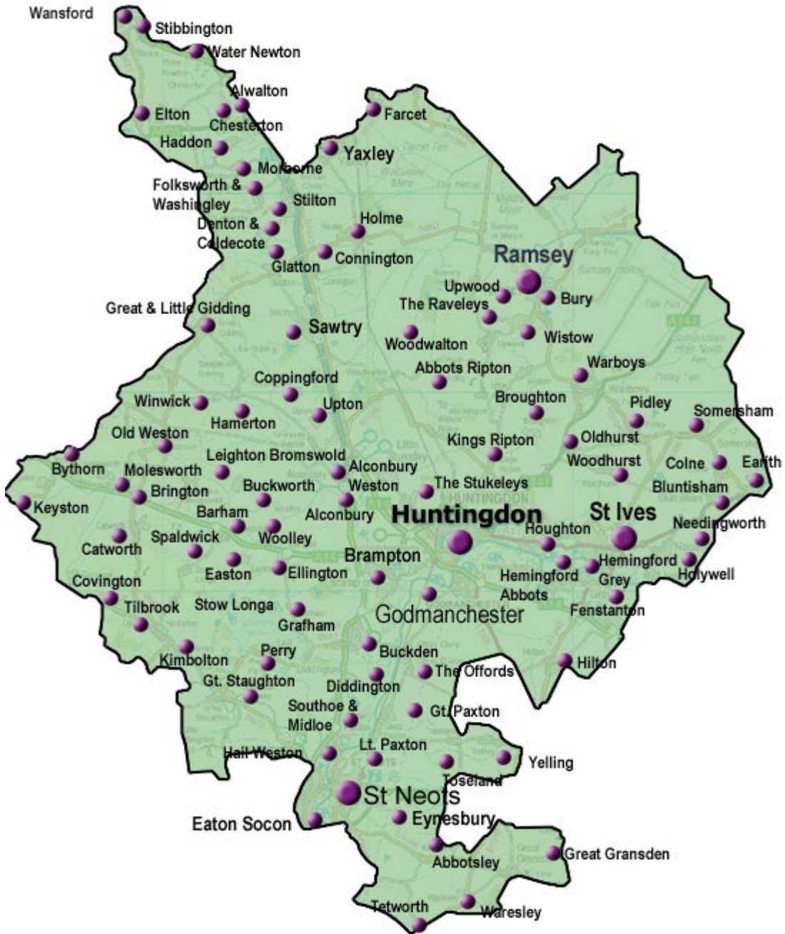
Based on the Ordnance Survey Mapping.